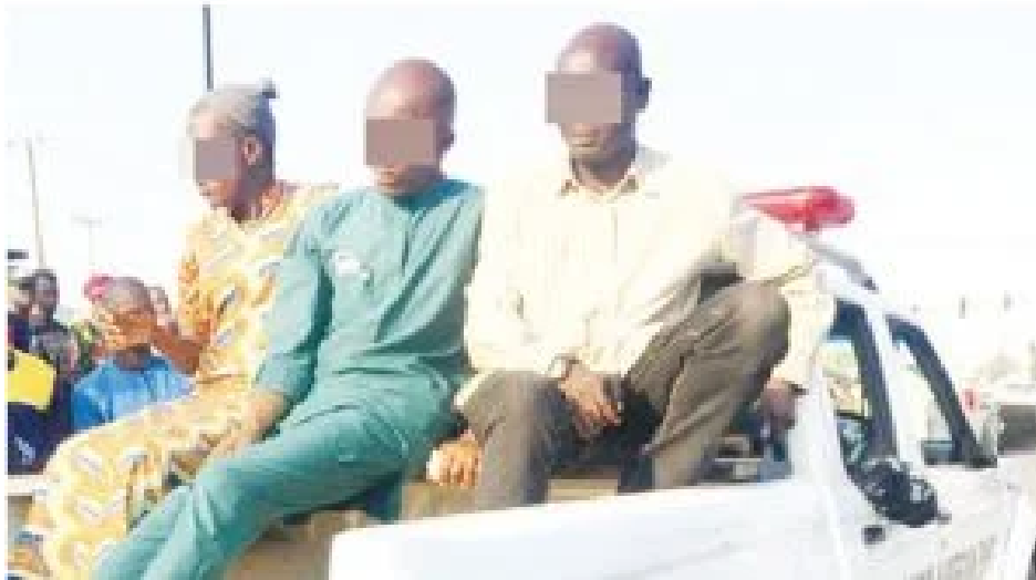
Scene of the incident

There was apprehension in the Berger area of Lagos State on Monday after the lifeless body of a bus driver was found near a motor park.