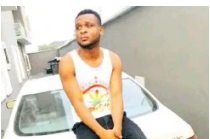
Cultists kill Lagos trader in sister's presence, family slams police