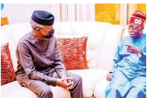
Tinubu pays surprise visit to Osinbajo