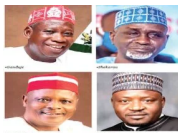
Kwankwaso's NNPP turns new bride in Kano as mass defection hits APC