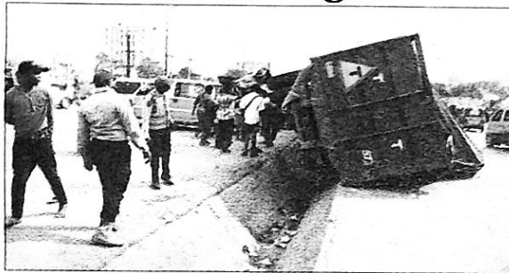
• Scene of the Anambra crash