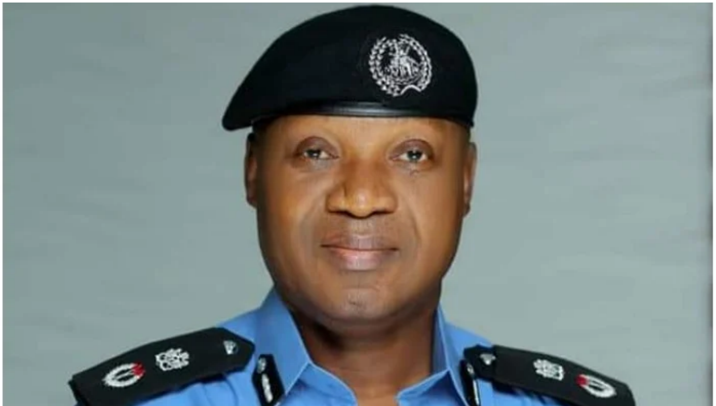
Lagos Police Commissioner, Abiodun Alabi

There was pandemonium in the Ipaja area of Lagos State on Monday when motorcycle riders protesting the killing of their colleague clashed with some persons linked to the death.