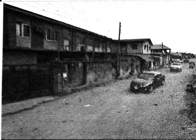
• Unity Street

They were said to have contacted the police, who recovered the remains and deposited them in a mortuary.