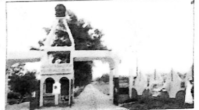
Adekunle Ogundoyin Polytechnic

described as incessant police brutality, especially against students along the Ibadan-Eruwa Road.