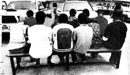
Some of the suspects and recovered weapons

"They asked me what I would be doing in Lagos and I said I would be working as a nanny."