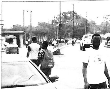
Scene of the incident

Our correspondent gathered that as the officials approached the Berger end of the expressway, they navigated a bend around the