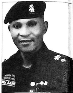
Task force chairman

started throwing stones and sticks at the task force officials. When the attack became much, the officials entered their vehicles and fled the area.