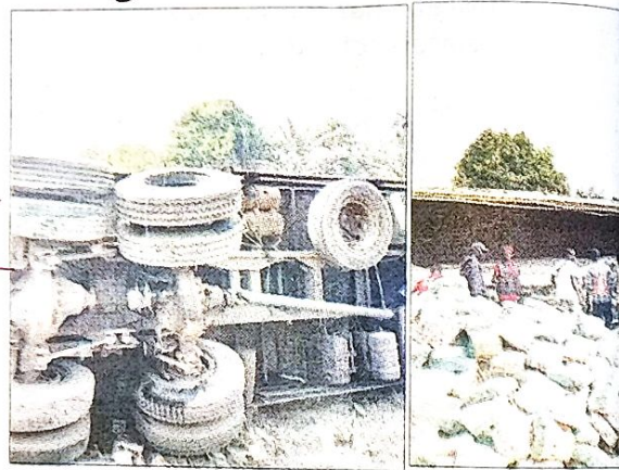
• The Ondo accident scene

"Three persons were recorded dead from the crash – two males and a female. Two vehicles were involved,