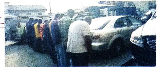
• The suspects