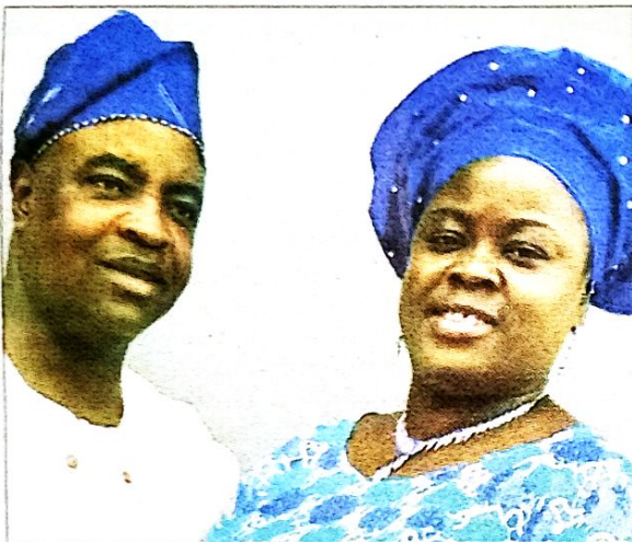
• The couple