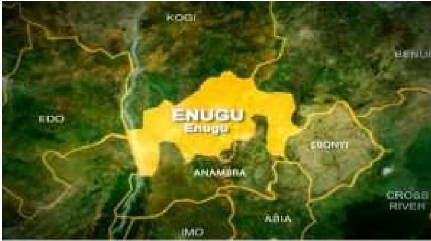
Map of Enugu State

Suspected Fulani herdsmen have reportedly attacked two Enugu communities, killing one and injuring another.