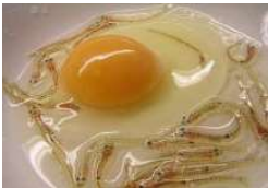
How to Cleanse Blood Vessels and Lower Cholesterol! Cardiovax