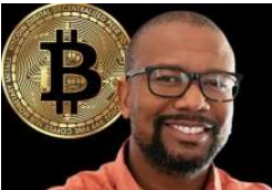
Suleja Millionaire Reveals How to Get Rich with Bitcoin, Without Buying Bitcoin