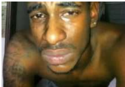
Suleja Man in Tears After Wife Exposes His 3 Year Secret Job Daily News