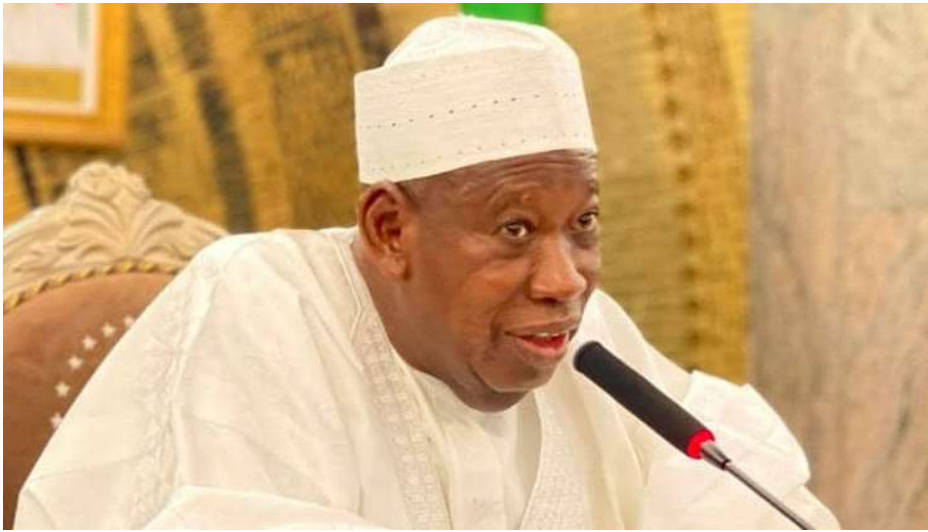
Kano State Governor, Abdullahi Ganduje

*Don't take products not approved by NAFDAC, Lagos warns