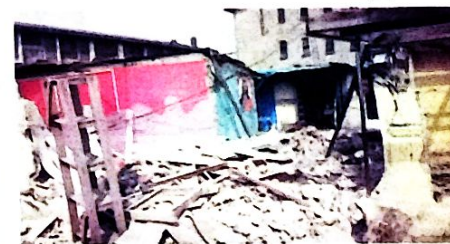
• Some of the demolished shops