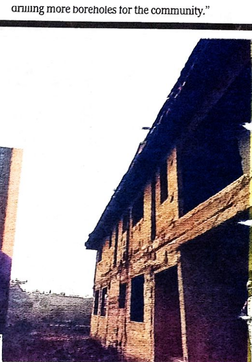
•Scene of the affected houses and palm plantation