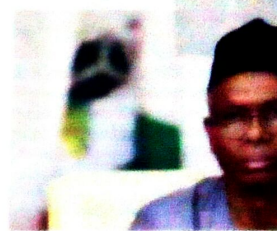
• Kaduna Gov, Nasir El-Rufai

"Many of the bandits escaped into the forest with gunshot wounds, having been denied