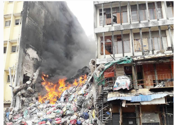
The scene of fire at Balogun Market