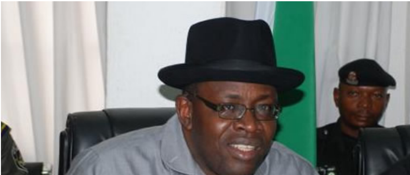
Bayelsa State Governor Seriake Dickson