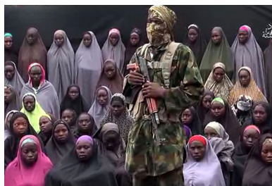
Army rescues one Chibok schoolgirl near Cameroon border