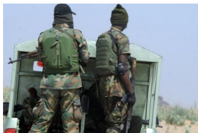
Troops kill suspected cattle rustler in Katsina