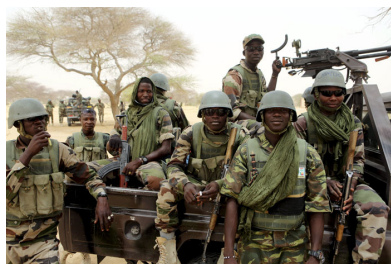
Soldiers kill three Boko Haram terrorists, recover weapons in Borno