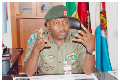
Troops kill 13 insurgents in Borno