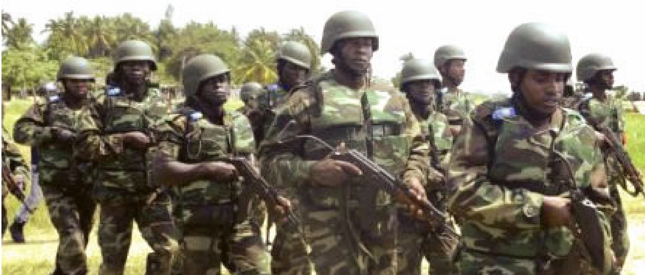
Some armed soldiers