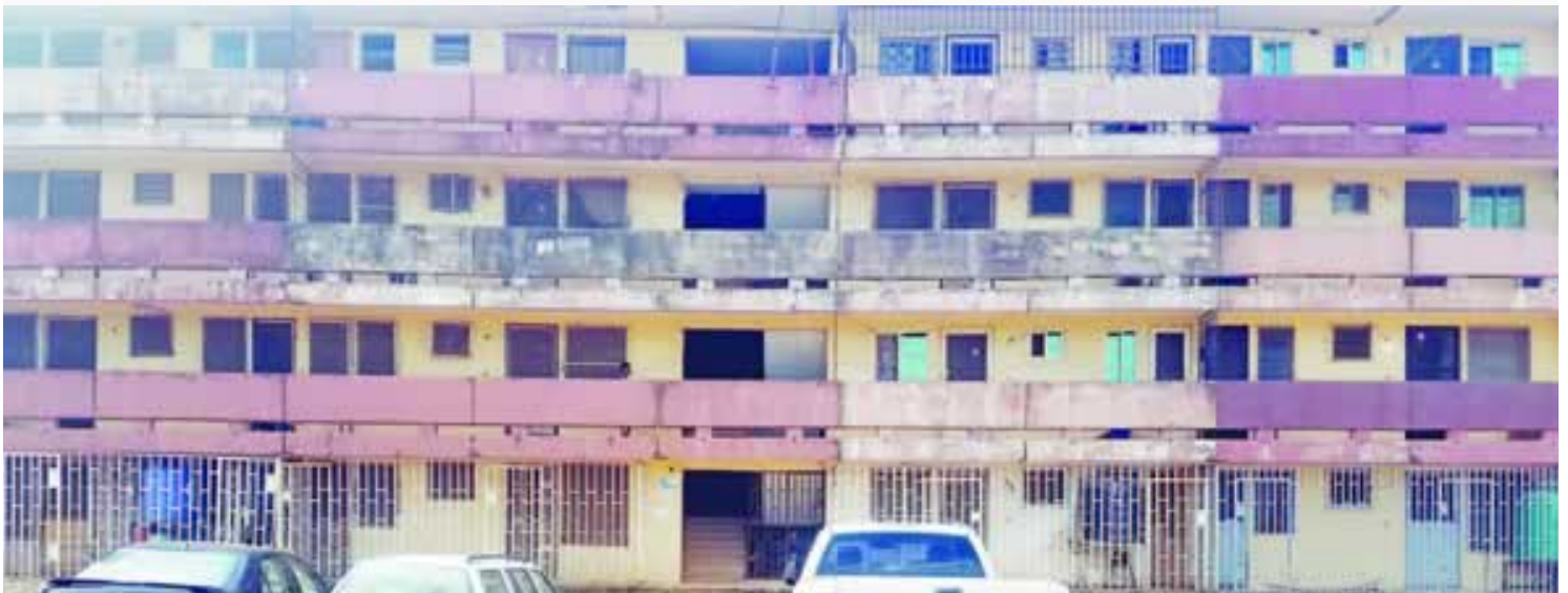
The Customs Block 10