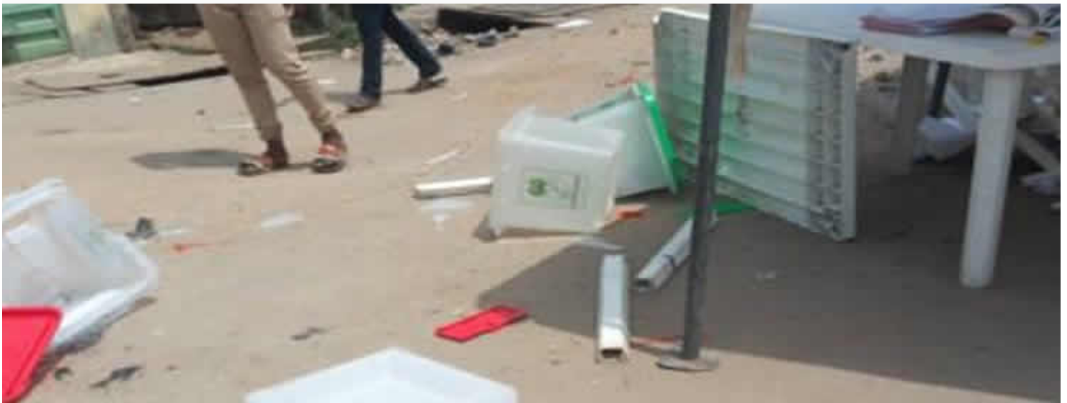
Scene of a voting zone where thugs disrupted the exercise.