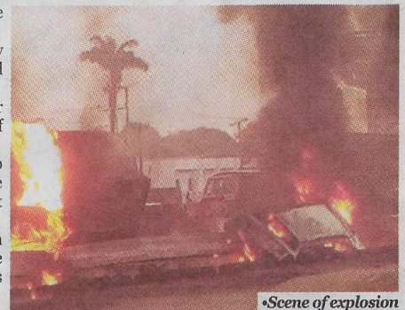
Scene of explosion

He said, "The accident could have been avoided if traffic rules and regulations were obeyed. Drivers should abide by traffic rules to avoid tragedies of this nature."