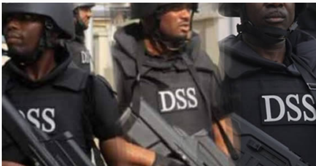
DSS operatives, File Photo