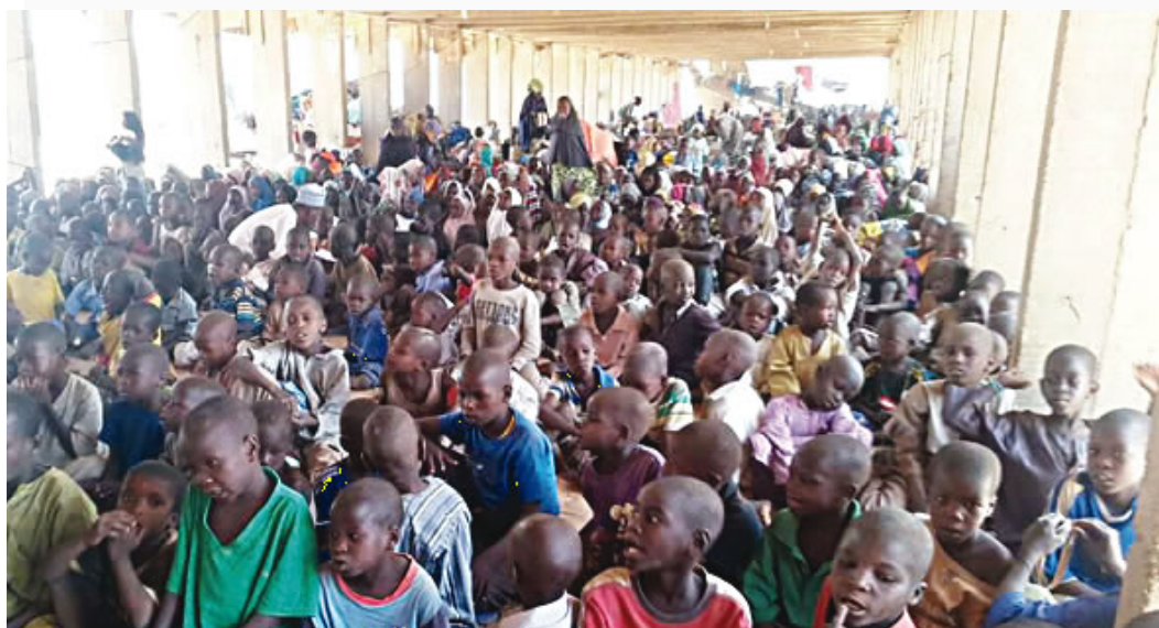
Internally Displaced Persons. File Photo