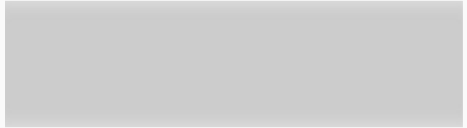
Repentant cattle rustlers surrender 104 guns, other weapons