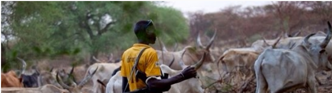
Ending deadly herdsmen attacks