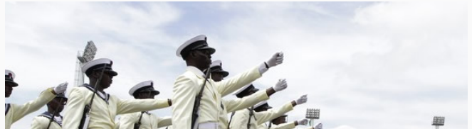
Navy averts Anambra herdsmen, farmers' clash