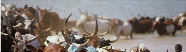
Herdsmen kill 20 farmers inside mosque – Police