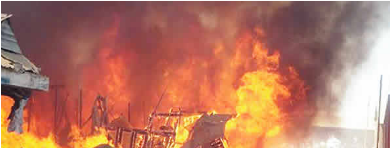
Scene of a fire incident