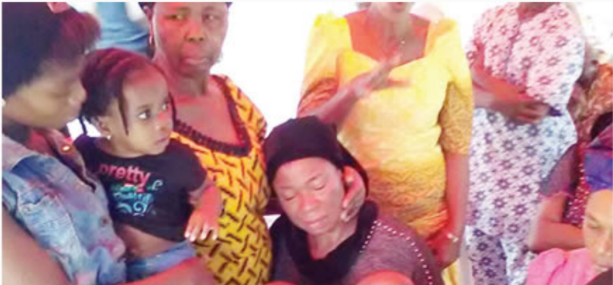
Victim's family at the burial.