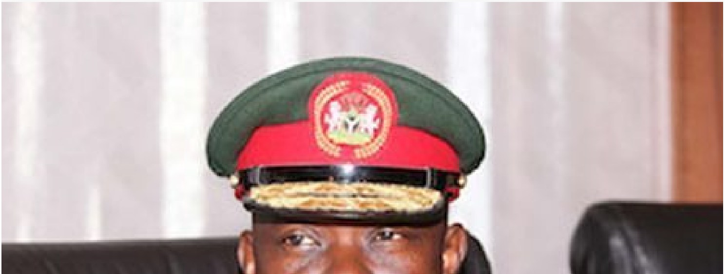
Chief of Defence Staff, Gen. Abayomi Olonishakin