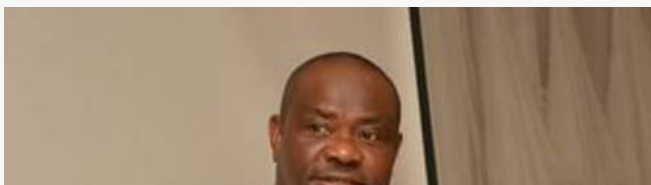
Amnesty: Cultists surrender arms, ammunition in Rivers