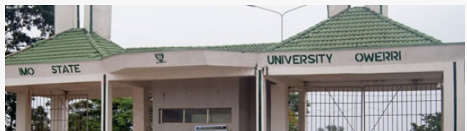
Cultists kill Imo undergraduate over phone