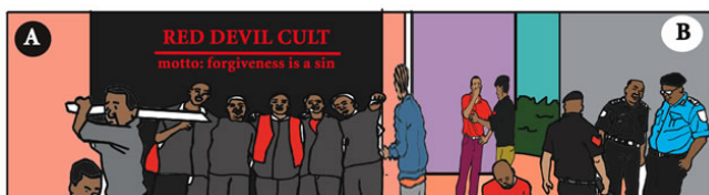
28 suspected teenage cultists arrested in Delta