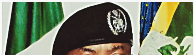
CP seeks stiffer punishment for cultism