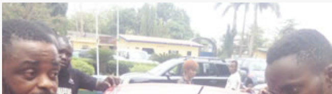
Passengers strangle Uber driver, flee with car