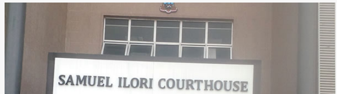
55-year-old guard abducts, rapes 14-year-old for four days