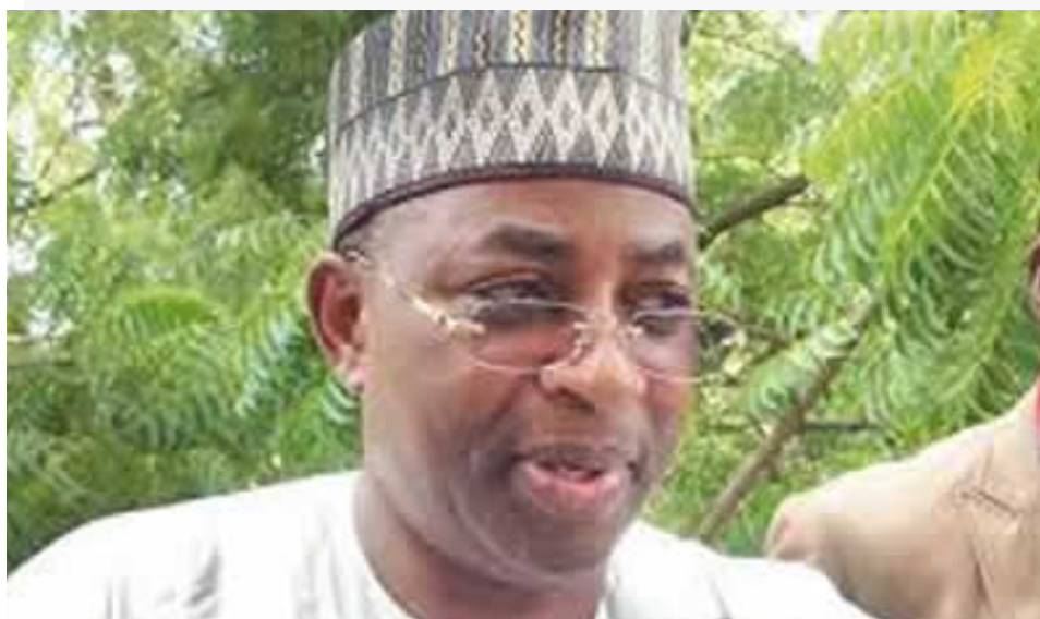
Bauchi State Governor, Mohammed Abdullahi Abubakar