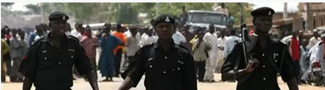
Police arrest NDLEA official, three others for attempted murder