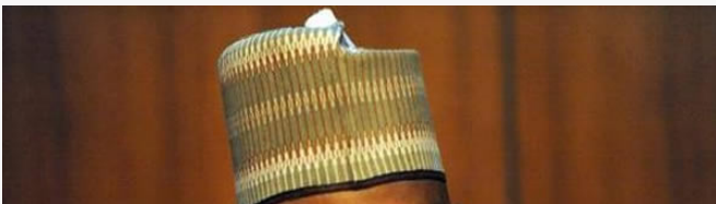
Attackers kidnap 17 fishermen, kill one in Borno