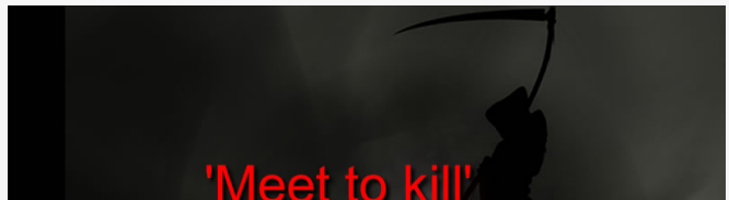
Gunman called 'Meet to Kill' admits killing Cambodian critic