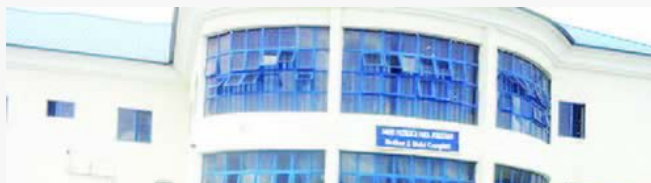
Bayelsa couple to face murder charges for killing boy