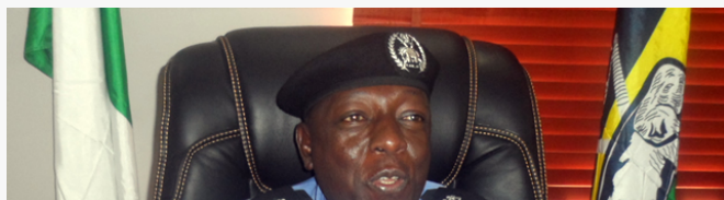
One killed as cult groups clash in Delta