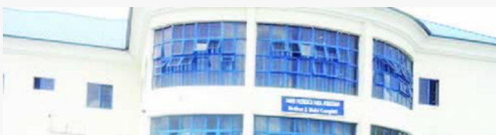
Bayelsa couple to face murder charges for killing boy