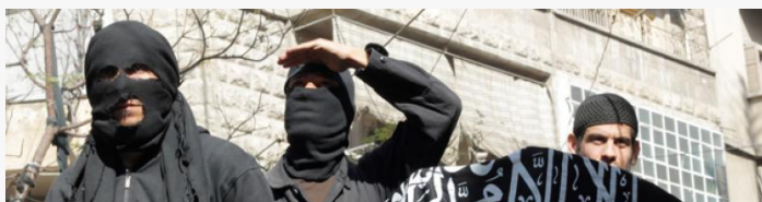
7 children die during raids