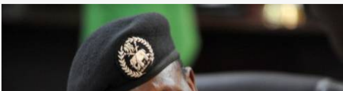
Engineer killed in Ado Ekiti, police beef up security