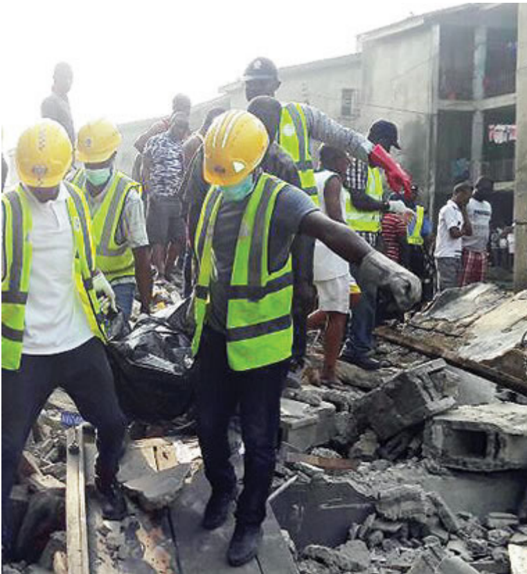
Rescue workers at the site of a collapsed building at the Police College Barracks, Ikeja, Lagos