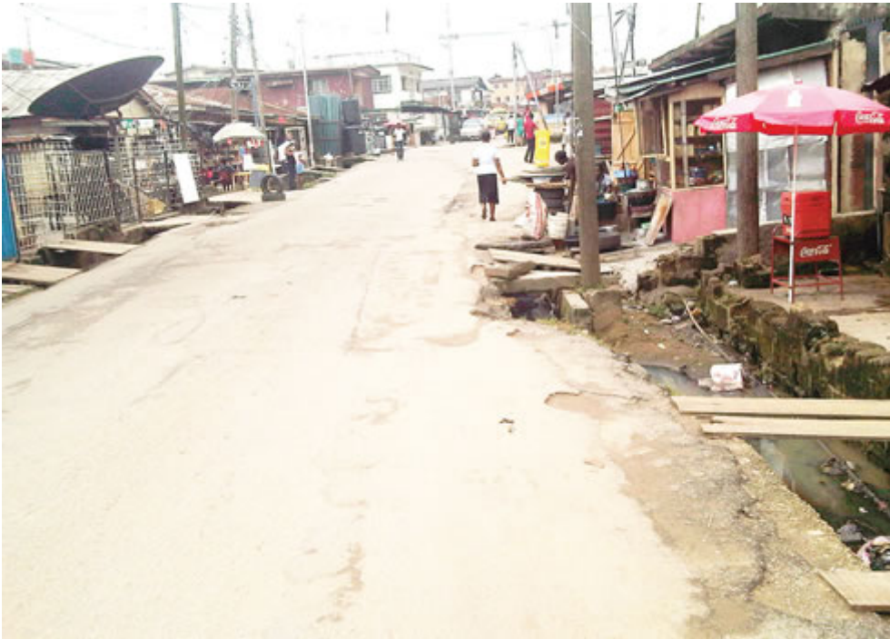
• Somolu area File photo