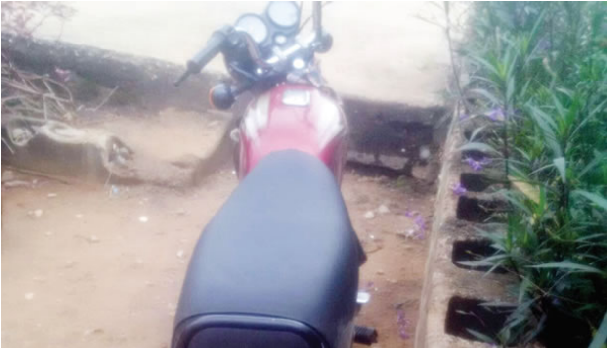
• The recovered motorcycle