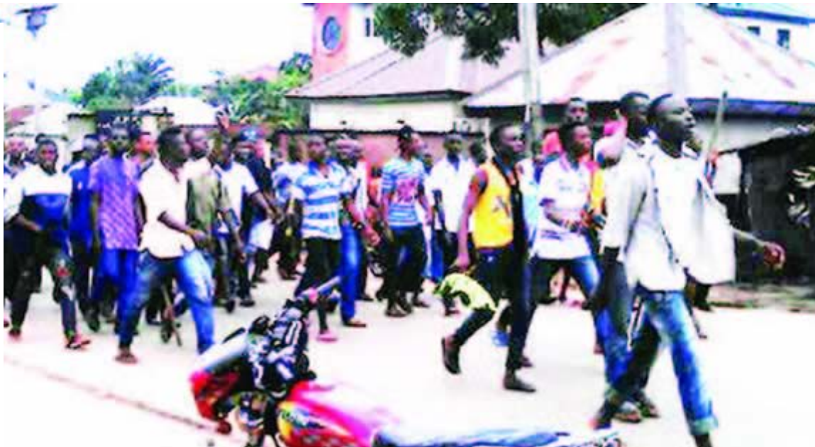
» protesting youths