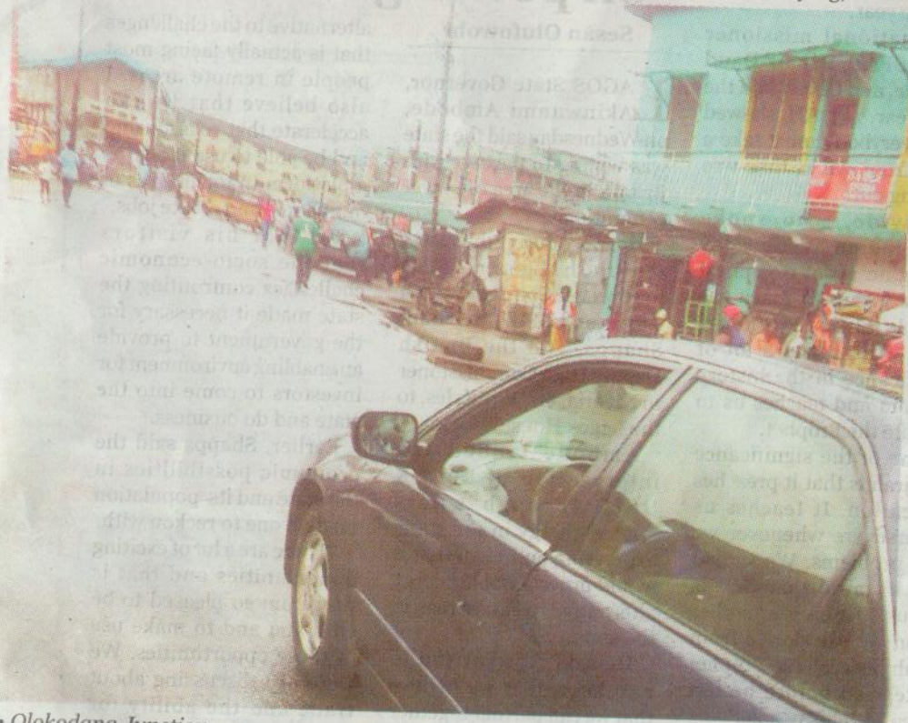
• Olokodana Junction

"Some voices inside the tricycles were saying, 'Gbee