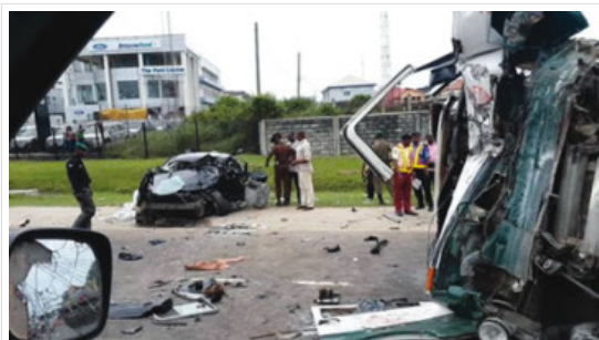
Scene of the accident

At least three people have been killed, while eight others are in critical condition after a commuter bus collided with a Toyota Corolla along the Lekki-Epe Expressway of Lagos State.