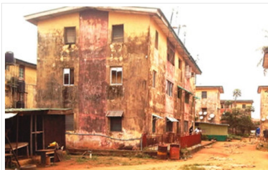
The family's apartment