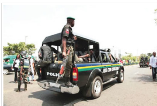
Some policemen on patrol