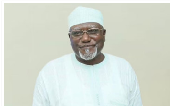
Acting Director General, Department of State Service, Mr. Lawal Musa Daura

Seven operatives of the Department of State Services had been reportedly killed in the Ikorodu area of Lagos State.