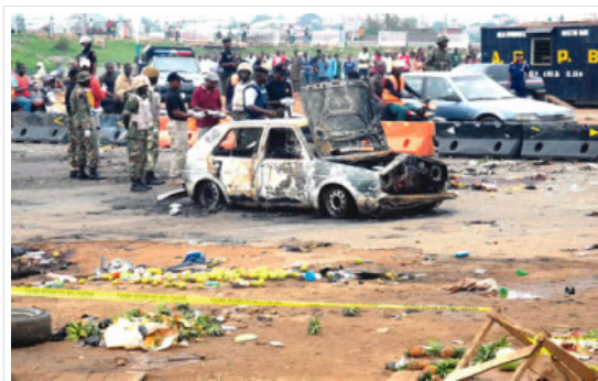
A burnt vehicle at the scene of an explosion