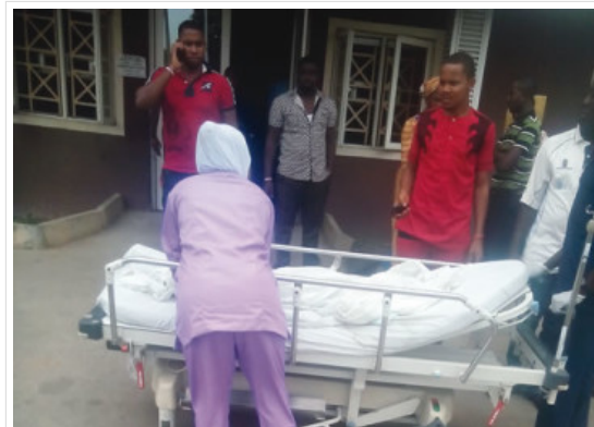
The girl being wheeled out