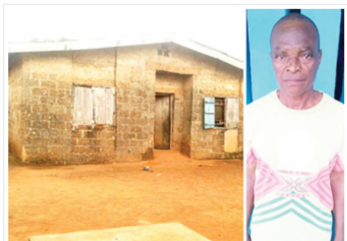
The house; the landlord