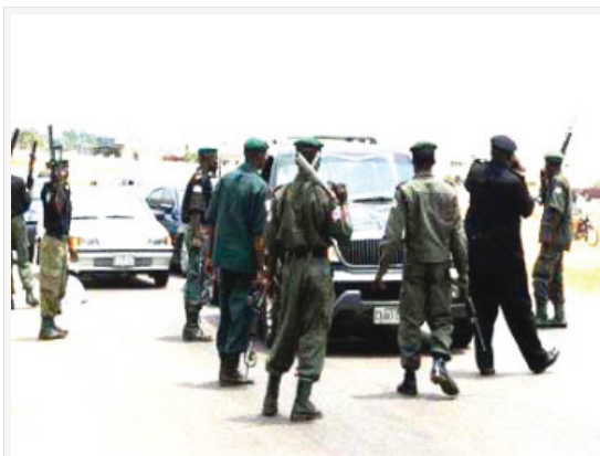
A police checkpoint