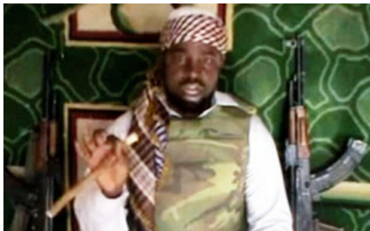
Boko Haram leader, Abubakar Shekau