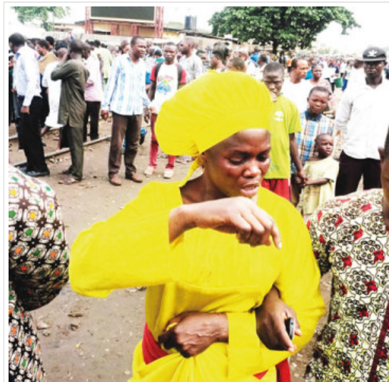
Scene of the accident; Evangelist (in yellow garment)